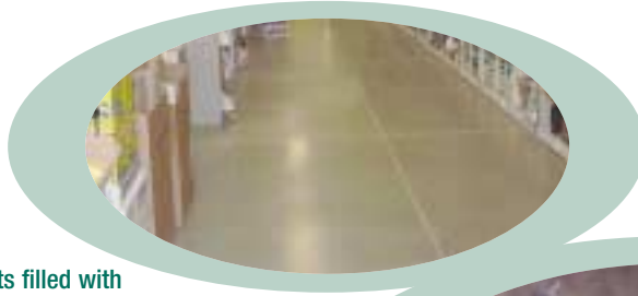
Joints filled with QWIKjoint 200 are well protected from the damaging effects of wheel traffic.

This product mixes in a convenient 1:1 ratio by volume, but due to its exceptionally quick cure time, it cannot be mixed or installed by hand. Power dispensing equipment is required.