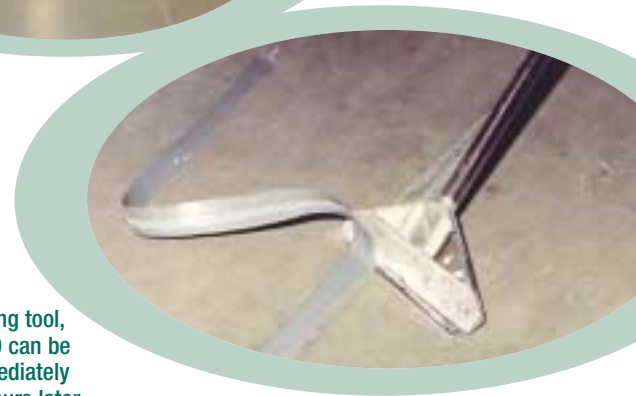
Using a shaving tool, QWIKjoint 200 can be trimmed immediately or up to 24 hours later.