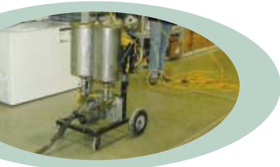
QWIKjoint 200 is installed with dual-feed automatic dispensing pumps.