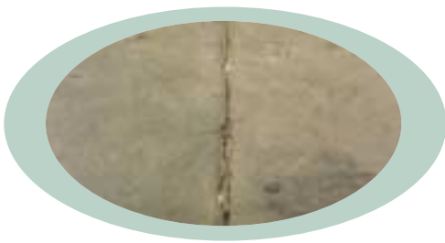
Unfilled joints will spall and deteriorate under heavy wheeled traffic.